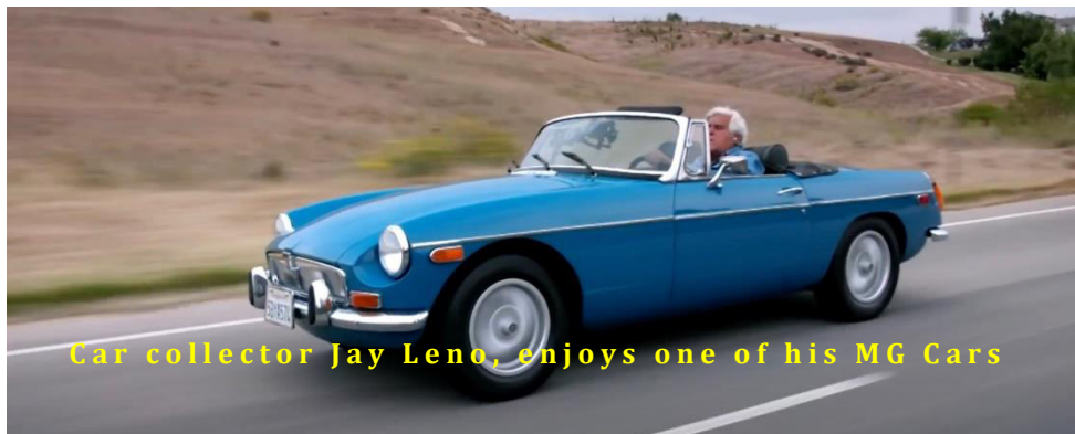
Car collector Jay Leno, enjoys one of his MG Cars