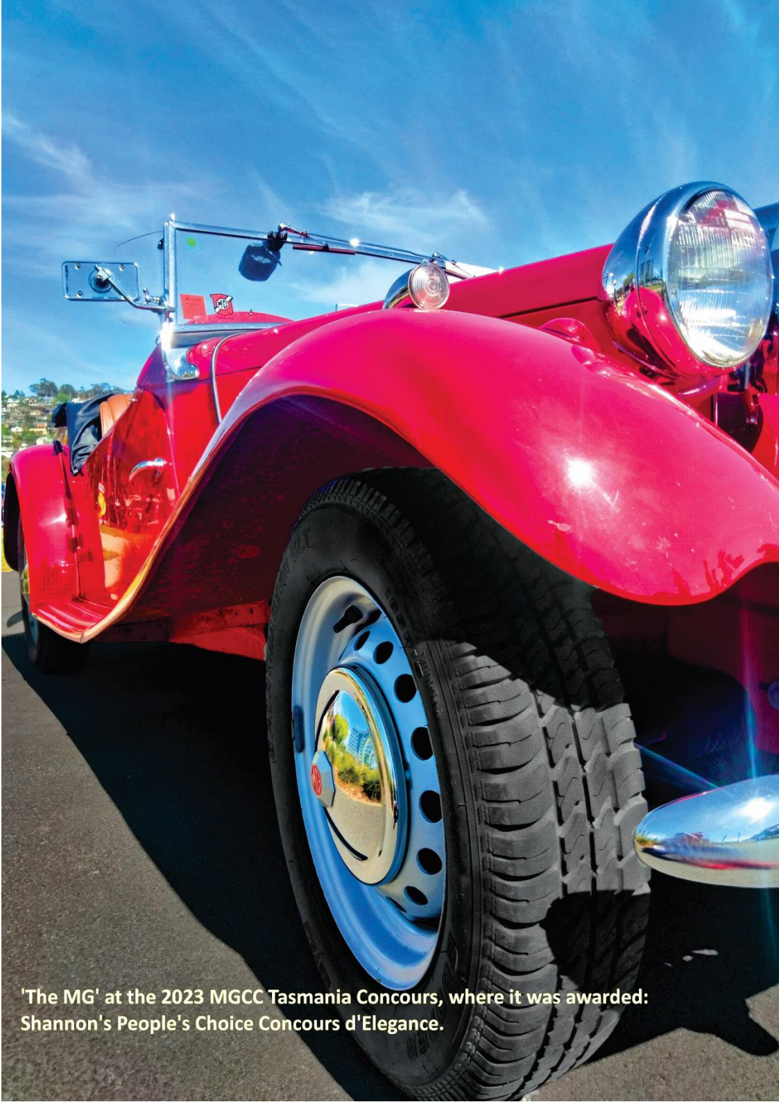
'The MG' at the 2023 MGCC Tasmania Concours, where it was awarded: Shannon's People's Choice Concours d'Elegance.